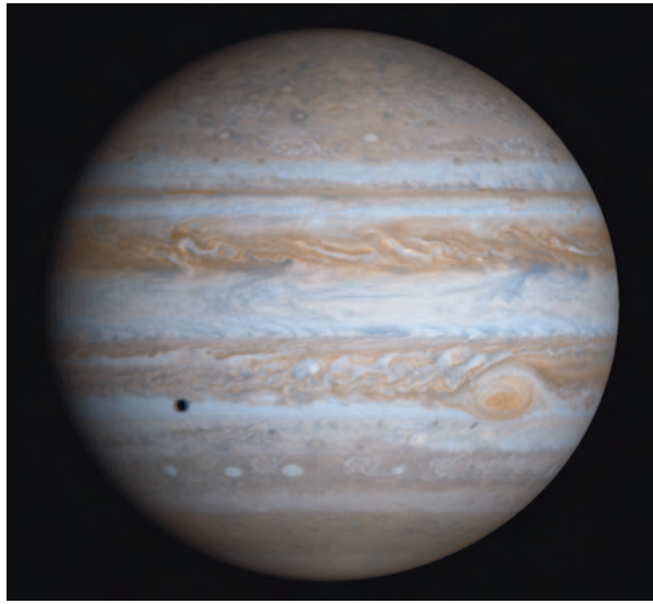
A Cassini view of Jupiter in 2000.

Jupiter's enormous magnetic field traps swarms of charged particles (electrons and ions) whose high-speed motion around the planet creates immense currents that drive Jupiter's powerful auroras. The Jovian magnetosphere, comprising these particles and fields, balloons 1 million to 3 million kilometers (600,000 to 2 million miles) toward the Sun and tapers into a wind-